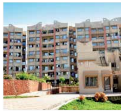
Royal Park (Ambernath)