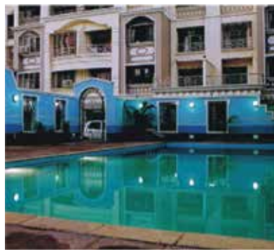
Swami Dev Prakash Gardens (Ambernath)