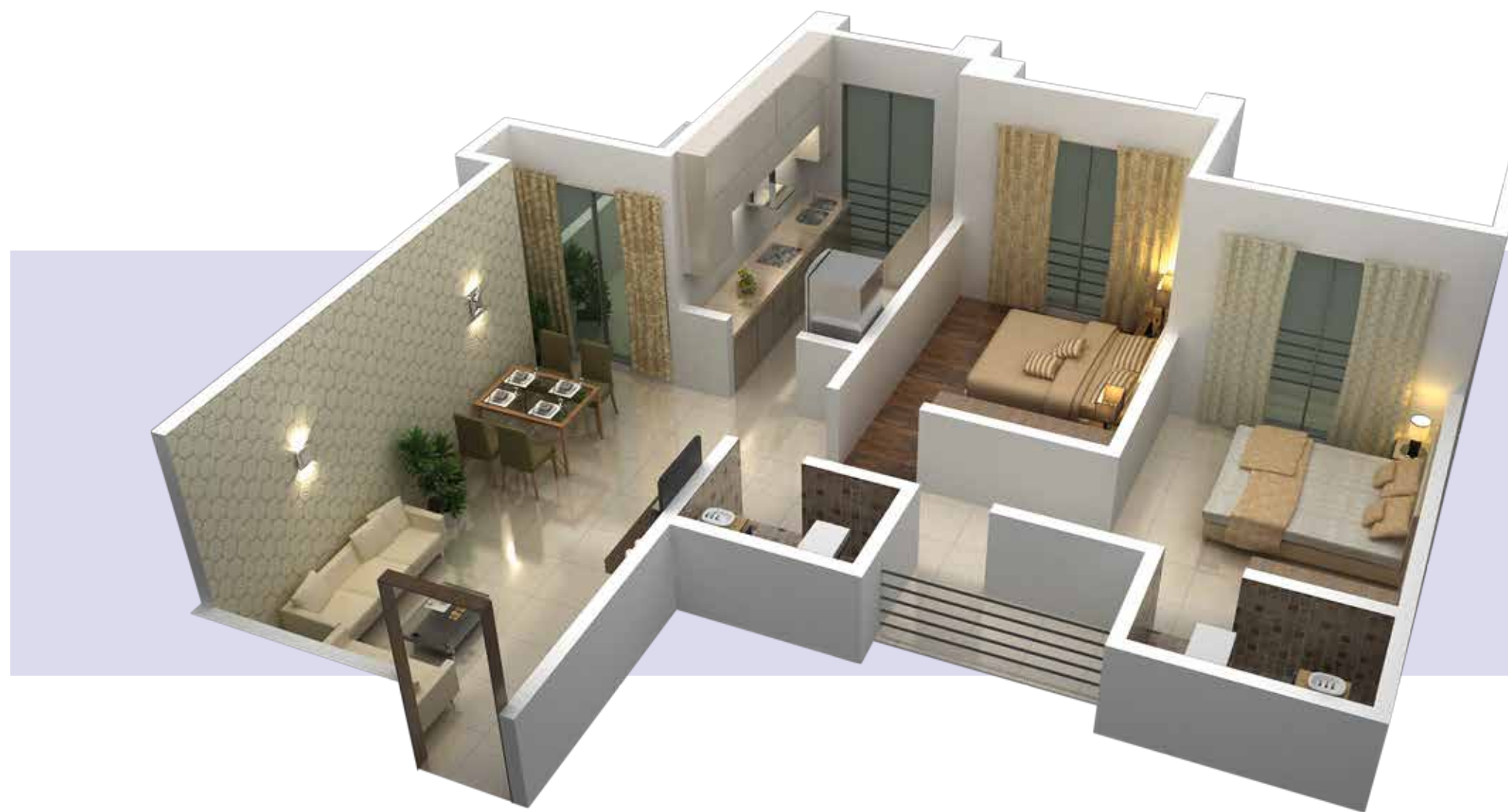
◀ 2 BHK - 3D VIEW