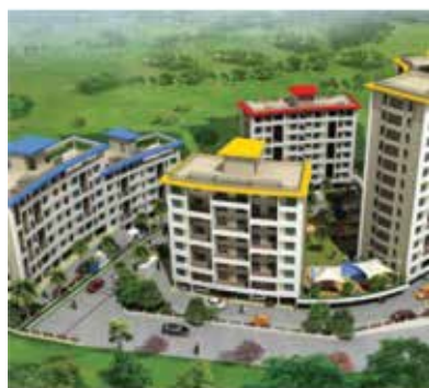
Aura-Solis Wanowri (Pune)