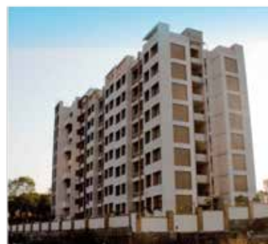
Meera Royale (Ambernath)