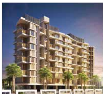
Meera Park Royale (Ambernath)