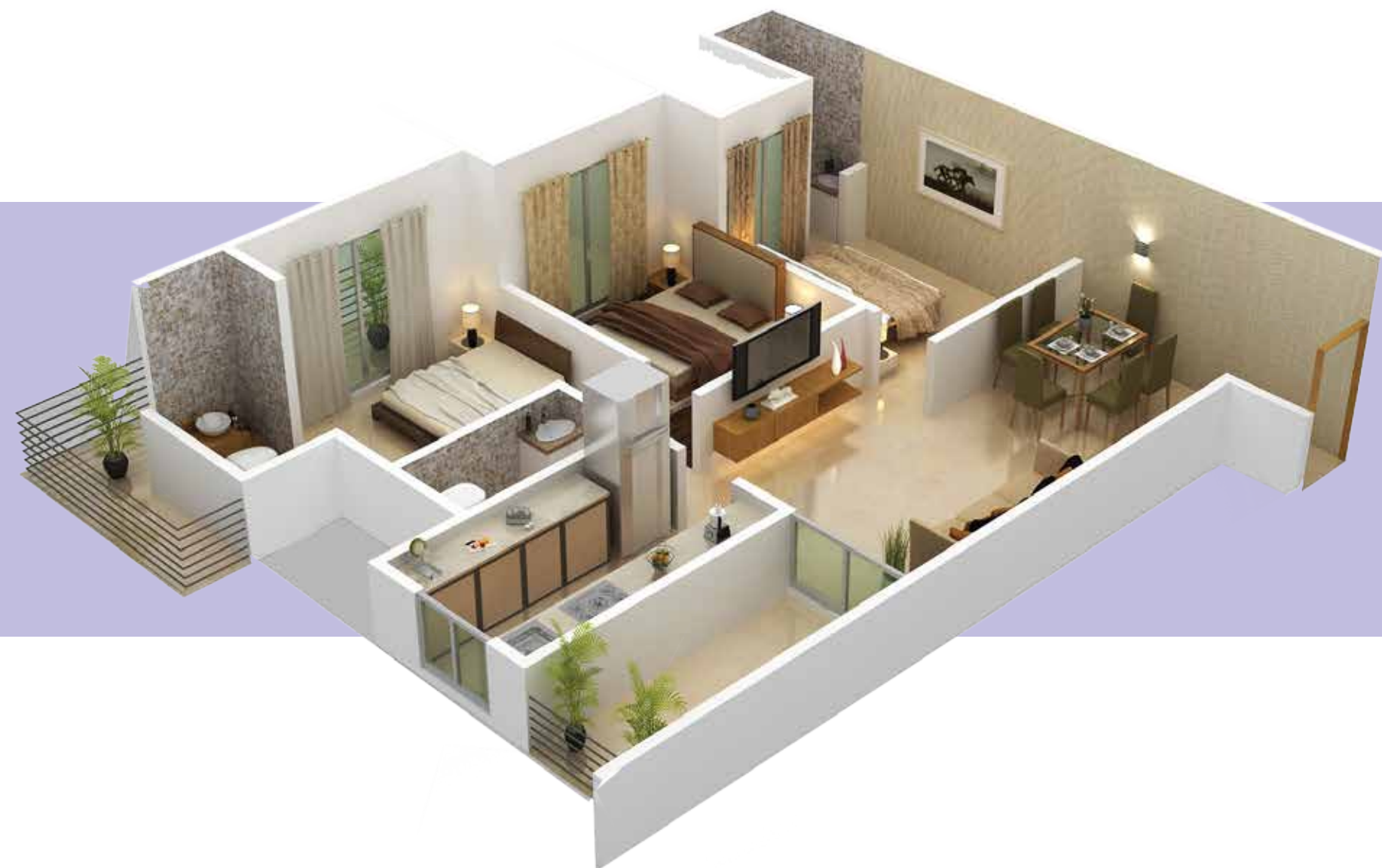
3 BHK - 3D VIEW ▶