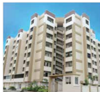
Meera Vatika (Ambernath)